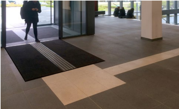
Clean-off mat with tactile guidance system